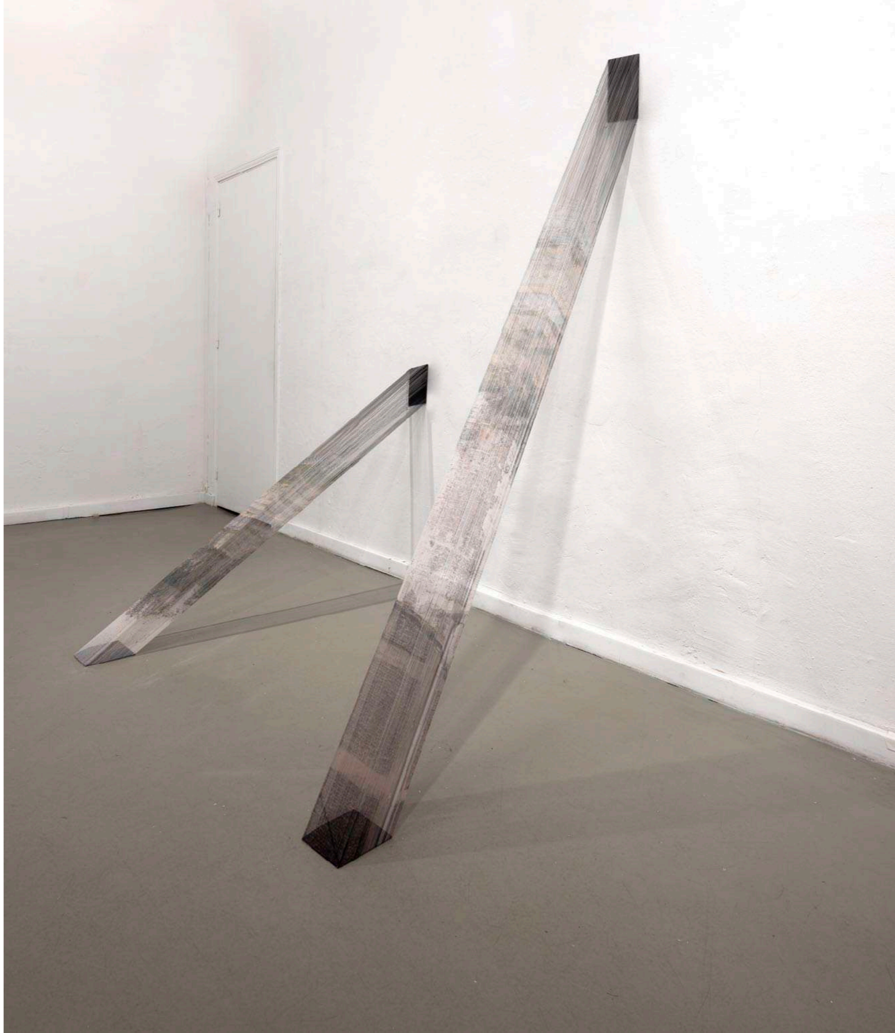
Stratigraphic Struts 2018 Sublimated polyester silk, metal, wood dimensions variable