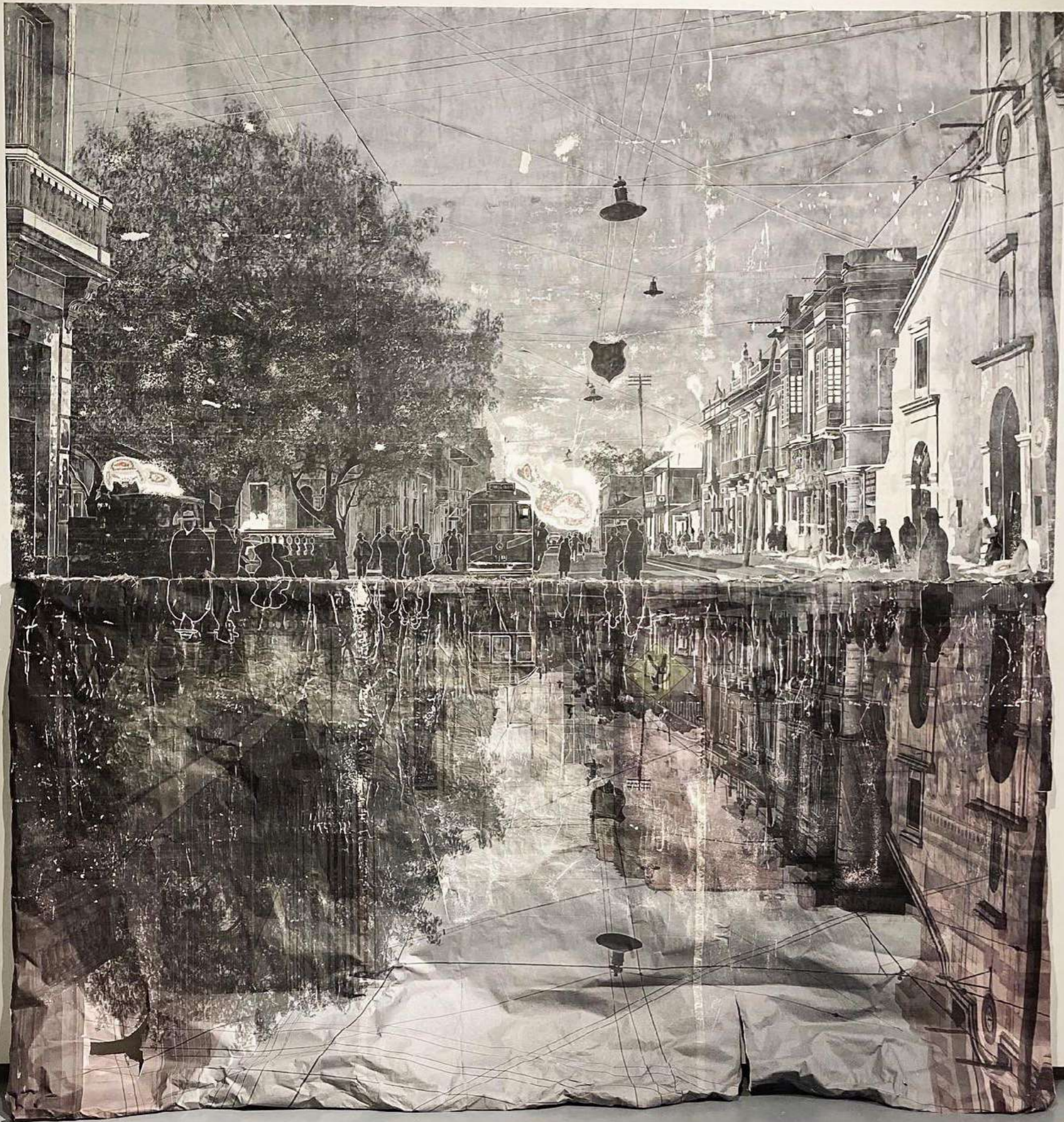
Removed (Las Nieves) 2023

In-situ drawing by scraping, mixed media