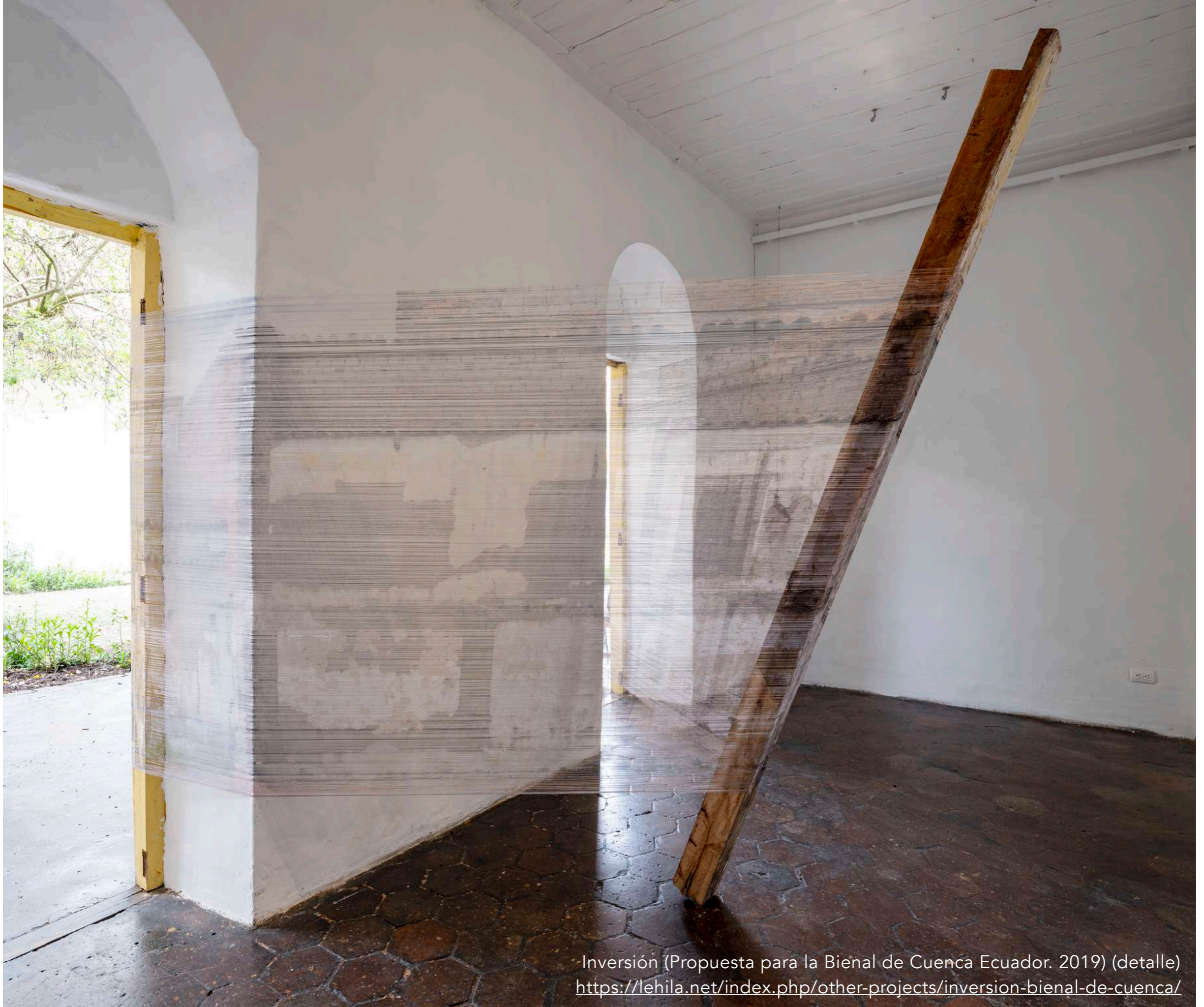
Inversión (Propuesta para la Bienal de Cuenca Ecuador. 2019) (detalle) https://lehila.net/index.php/other-projects/inversion-bienal-de-cuenca/