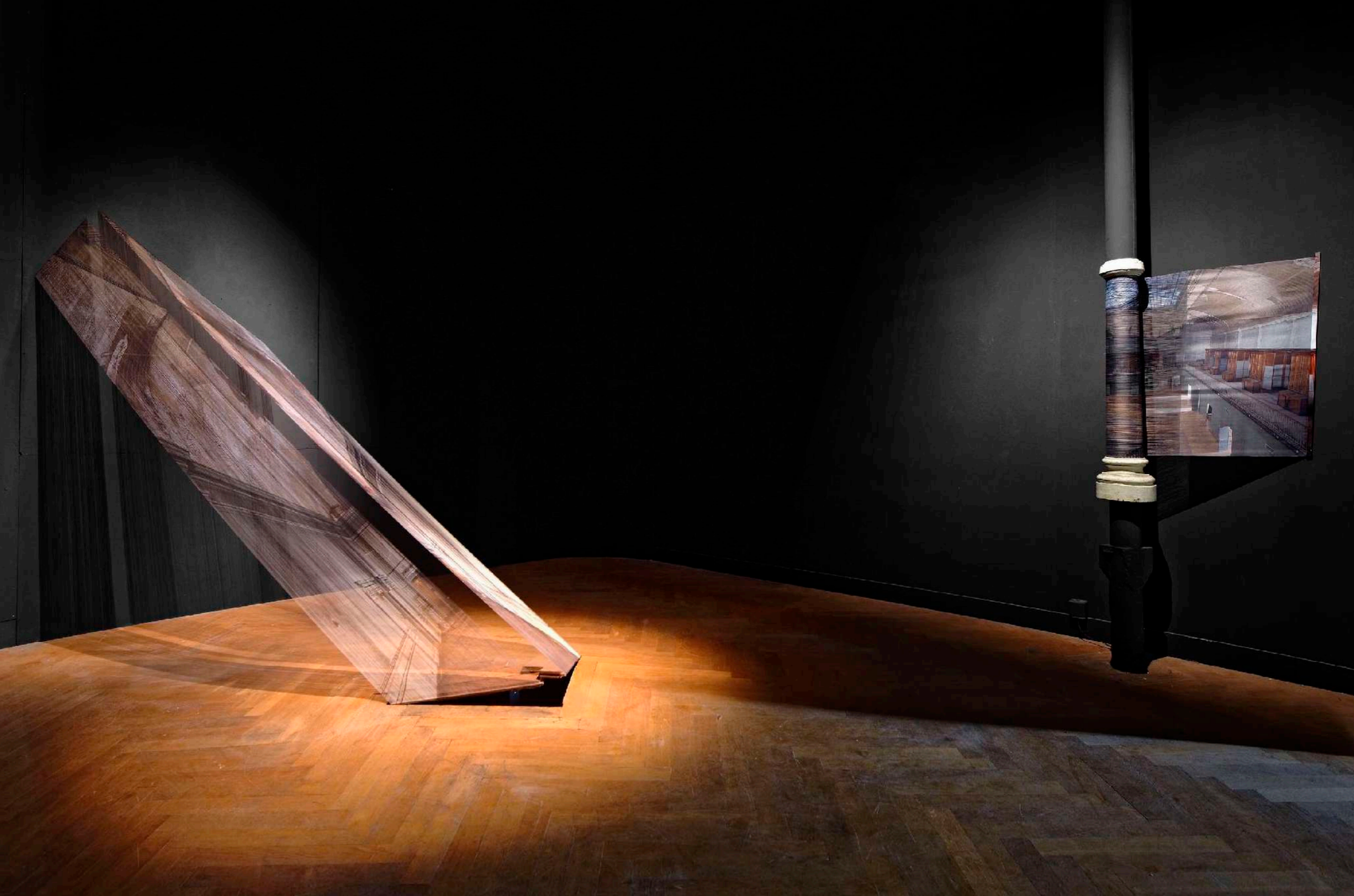
Self-contained withstander Project for 16e Biennale de Lyon : Manifesto of Fragility. Musée d'histoire naturelle- Guimet [LYON] 2022

Photographs dye-sublimated on polyester silk un-weaved.