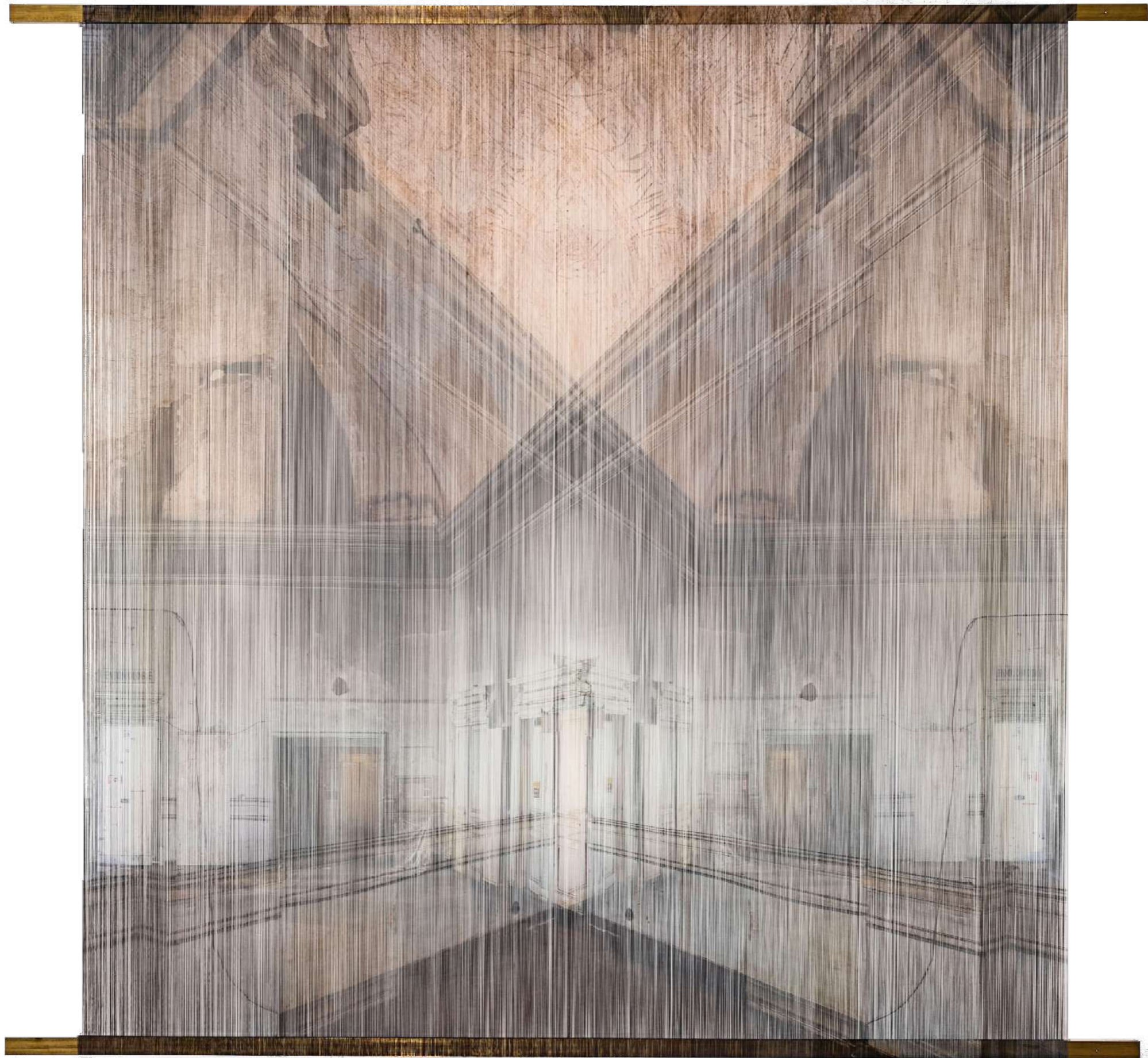
Unfolded Guimet Museum 1 2023

Unweaved dye-sublimated polyester silk, bronze. 152 x 163 x 2,2 cms