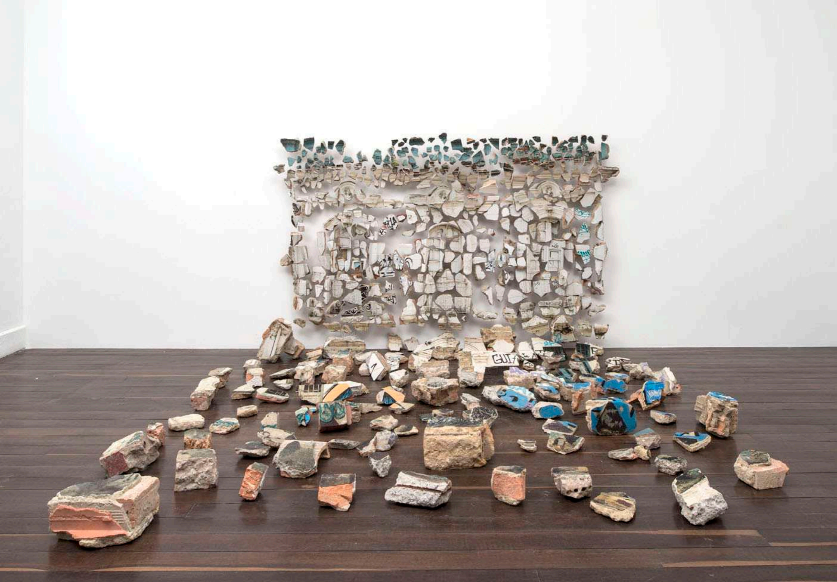
Permutaciones Estudio # 1. 2014 Inkjet print mounted on demolition rubble 280 x 150 x 290 cm