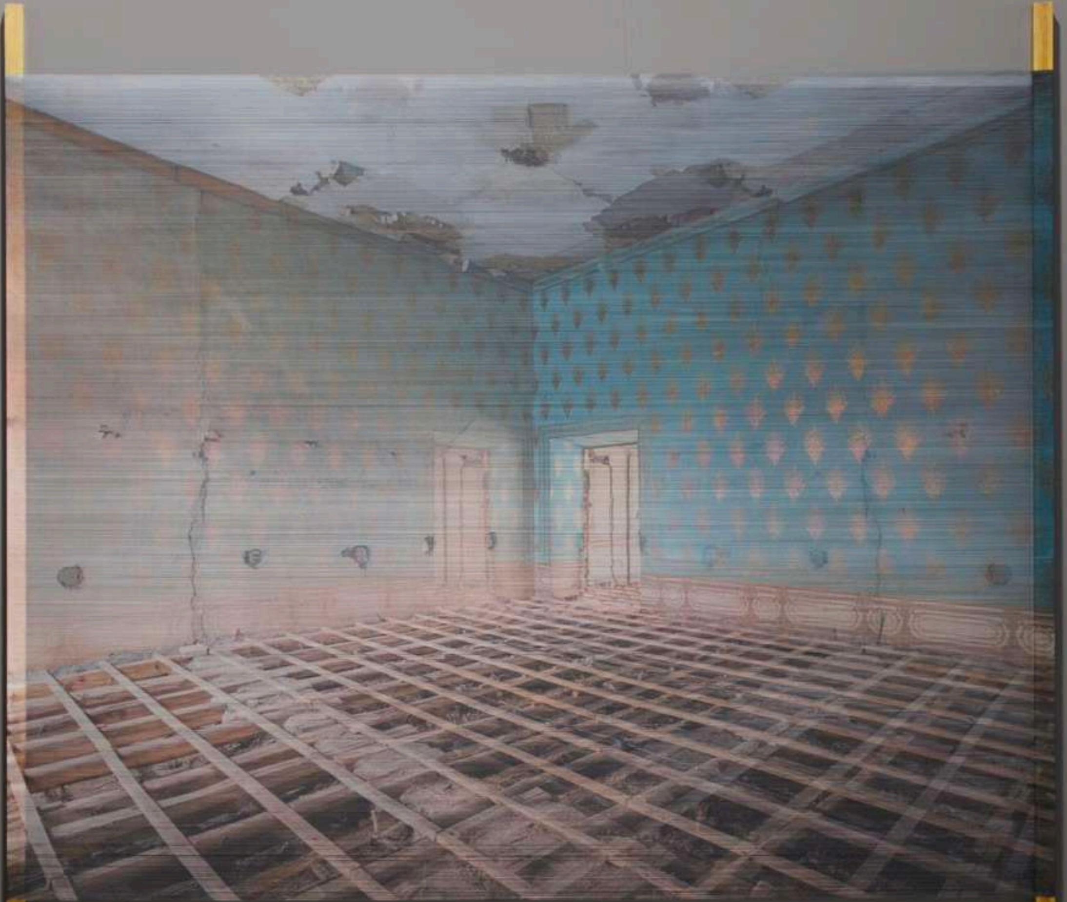
Unfolded room for Rivet 3 (from the middle of the world), 2022